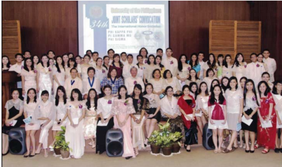
The chapter cosponsored a Recognition Convocation with the Phi Kappa Phi and Phi Sigma chapters on campus on March 18, 2016 to recognize summa cum laude and magna cum laude graduating students.