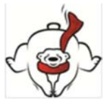
Wilmu Polar Bear Plunge (sponsored by Pi Gamma Mu and the Wilmu Alumni Association)