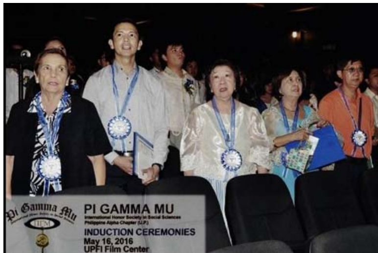
Jubilarians at the Induction Ceremony