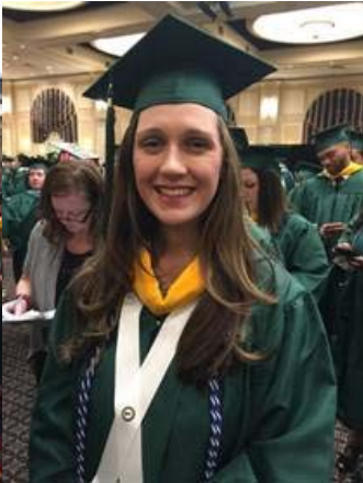
Students getting ready in the robing area at the Chase Center Riverfront commencement on Sunday, May 22, 2016.