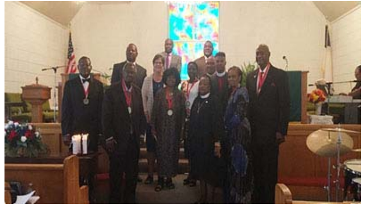
Photo shot from the Historical Mt. Zion United Methodist Church – 54th Anniversary Commemorative Service for James Chaney, Andrew Goodman and Michael Schwerner.