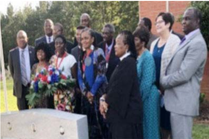
L-R Standing in front of a Memorial Monument paying tribute to the three slain civil rights workers, Chaney, Goodman, and Schwerner at Mt. Zion United Methodist Church in Philadelphia, MS.