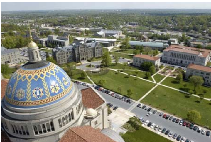
The Catholic University of America, Washington, DC

The 2020 Pi Gamma Mu Awards Banquet will be held on Friday, November 13 during the 2020 Triennial International Convention. It is an event you won't want to miss!