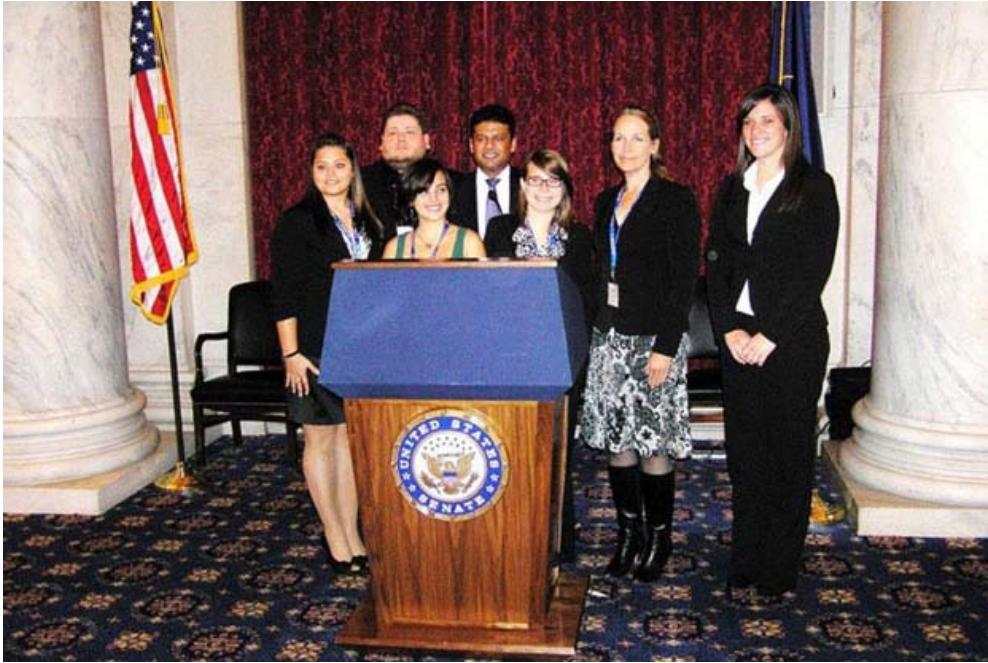
At the 2011 Convention, 40 students presented their research in the ornate Kennedy Caucus Room of the Senate Office Building in Washington, DC.

Think about it! Presenting at an international academic convention looks great on a resume. Submit your papers now!