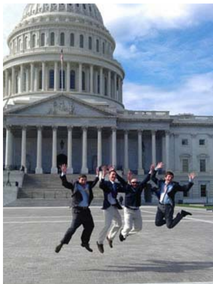
Members of Pi Gamma Mu celebrate during the 2011 Triennial International Convention in Washington DC

Join us for the second Leadership Development Program during the 2020 Triennial Convention! Program participants will learn about leadership in a variety of different contexts to include leadership in academia, stressful environments, non-profit organizations, public policy and in the United States Marine Corps. The program consists of workshops, lectures and a field trip to learn to the National Museum of the Marine Corps in Triangle, Virginia. While the program is tailored for undergraduate students, graduate students are welcome to attend. Students will earn a certificate of completion for their resume upon the conclusion of the program.