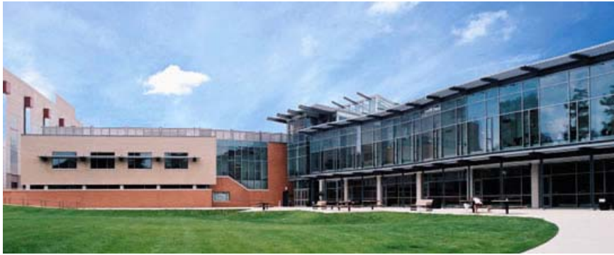
The Edward J. Prybyla University Center on the campus of Catholic University of America