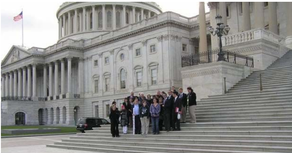
Students prepare to present their research on Capitol Hill at the 2011 Triennial International Convention in Washington, DC.